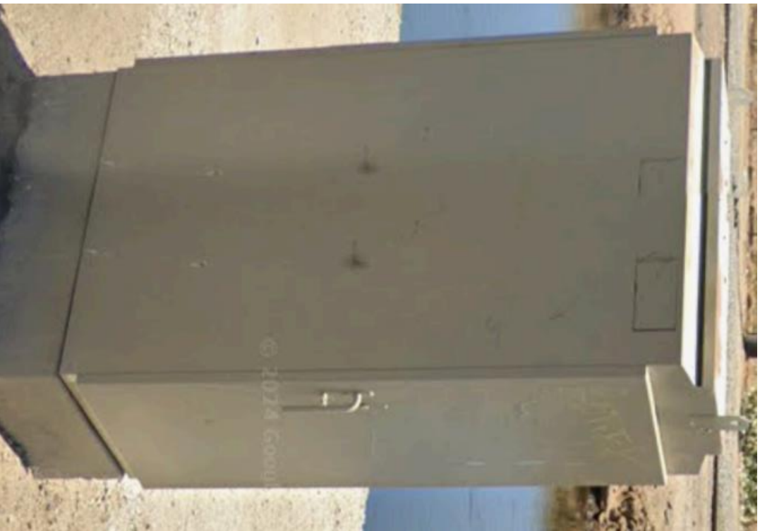
EXHIBIT A – PICTURES OF CITY OF FRESNO TRAFFIC CABINETS & SAMPLE ARTWORK